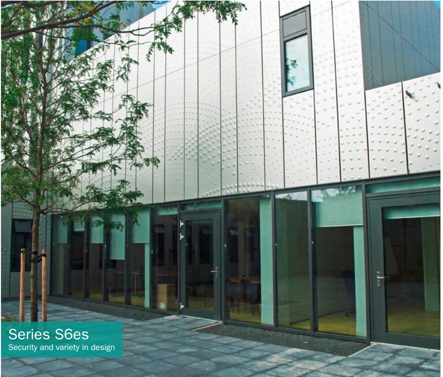
Series S6es Security and variety in design