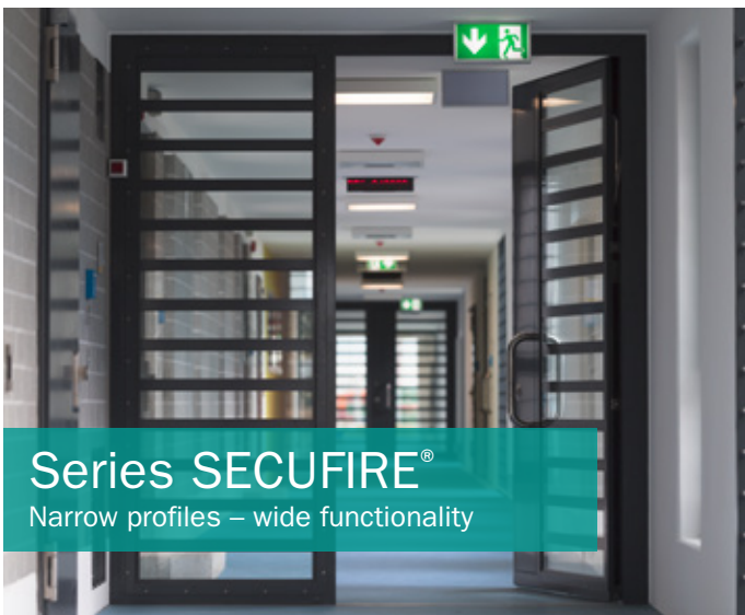
Series SECUFIRE® Narrow profiles – wide functionality