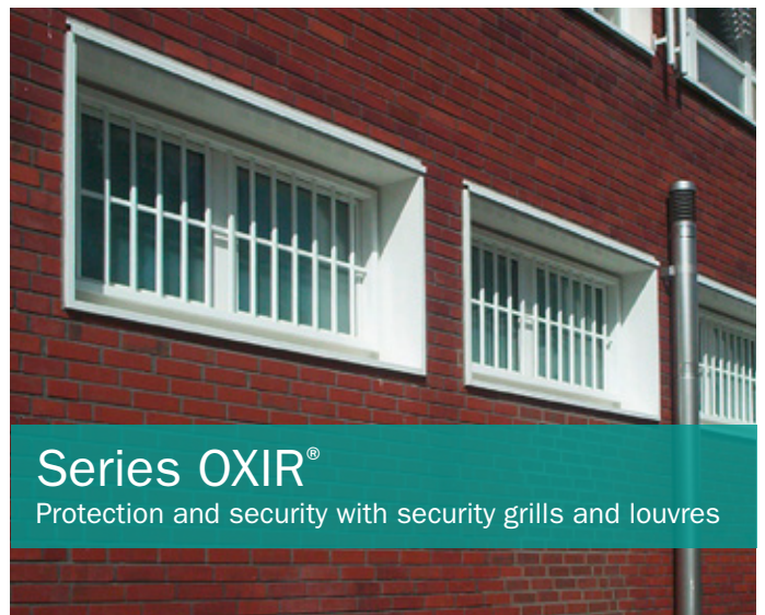
Series OXIR® Protection and security with security grills and louvres